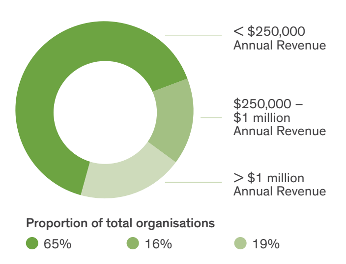
FIGURE 2*: ANNUAL REVENUE OF AUSTRALIAN CHARITIES<sup>33</sup>

As shown in Figure 2, the ACNC categorises charities and other CSOs in terms of the size of their annual revenue (as does CAV), with almost two-thirds (65 per cent) of organisations within this sector considered small.